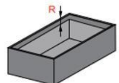
WRAPPED BOX 成品