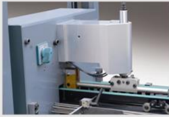
电控刀传动机构 Electric Cutter Transmission