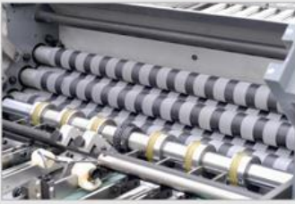
胶辊采用国际先进技术压注 Cast Rubber Roller Of International Advanced Technology