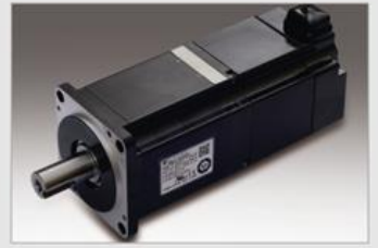
电控刀传动使用日本欧姆龙伺服电机 Electric Cutter With OMRON Servomotor Transmission Form Japan