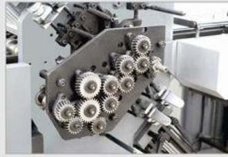
高精度的十字连轴器转动调整 High-precision Spindle Coupler Transmission